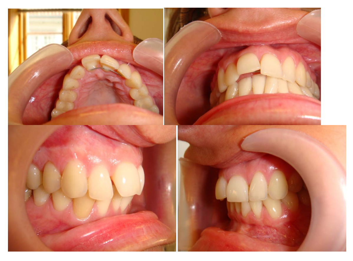
Failed fixed retainer in Norwegian patient. Removed and treated with a removable retainer only.