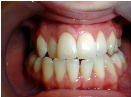
Failed fixed retainer case. Orthodontics in Norway twice with premolar extractions which had to be retreated with fixed appliances for a third time and surgery. Fixed retainers had been placed on both the upper and lower jaw from 3-3 in both jaws. Case now8 years post treatment with removable retainers.

"The long-term group presented higher calculus accumulation, greater marginal recession, and increased probing depth (P < 0.05). The results of this study raise the question of the appropriateness of lingual fixed retainers as a standard retention plan for all patients regardless of their attitude to dental hygiene. They also emphasize the importance of individual variability and cautious application of retention protocols after a thorough consideration of issues related to the anatomy of tissues and oral hygiene."