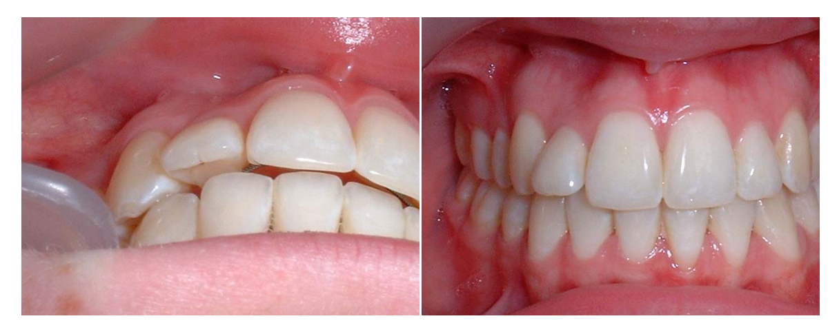
Failed Norwegian fixed retention case fixed retainers on both upper and lower jaws3-3. Paid for and treated twice. Offered a third course of fixed appliances. N.B.THE BUCCAL ROTATION.

Removed and treated by me with removable retainers only part time wear in 6 months.